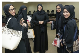
First a PhD, then perhaps a trip into space for female Emirati pilot