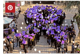
Skopje 2012, UN agencies, government and citizens united to end violence against women.