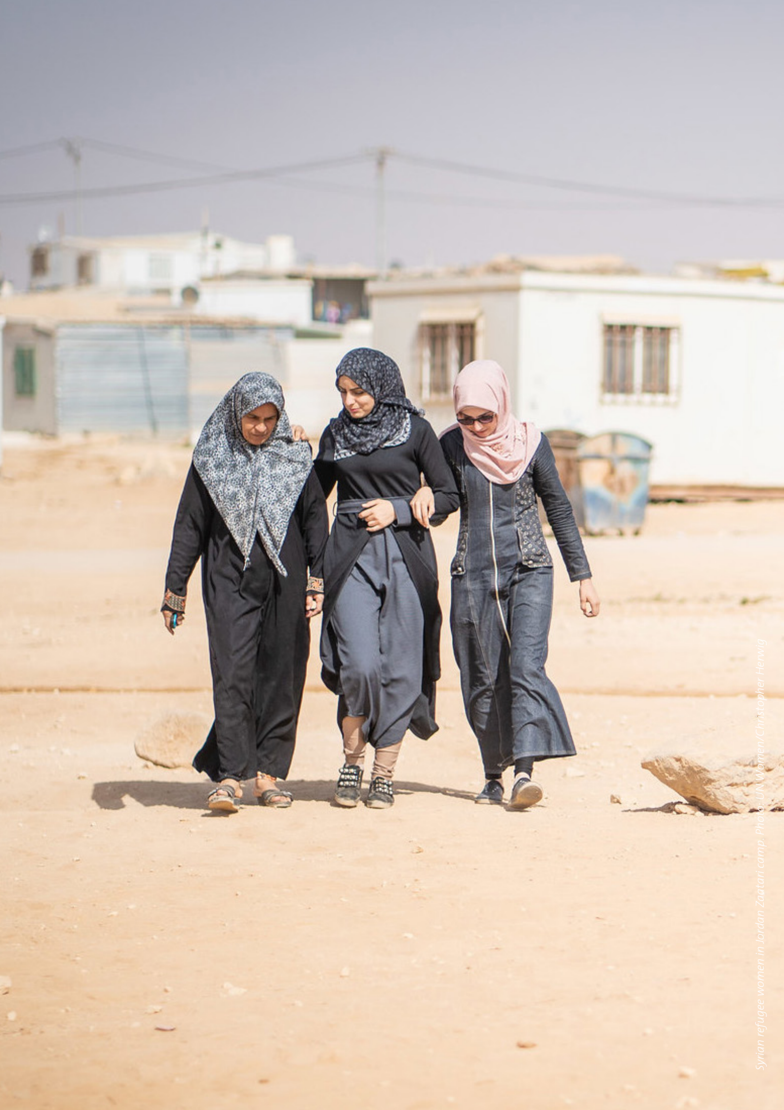
Syrian refugee women in Jordan Za'atari camp.