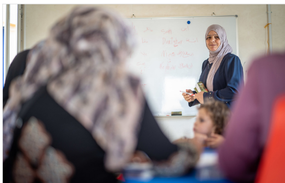
Syrian refugee women in Jordan Zaatari camp.

Many participants expressed the need to clarify or redefine key concepts – such as ‘martyrs’, ‘Jihadism’, ‘radicalization’ and ‘violent extremism’ itself – and the need for evidence- and gender-based approaches. They emphasize that there are risks of human rights violations when terms like ‘extremism’ or ‘radicalization’ are applied to non-violent activity. In this regard, participants suggested that regional comparative studies in the field could be useful.