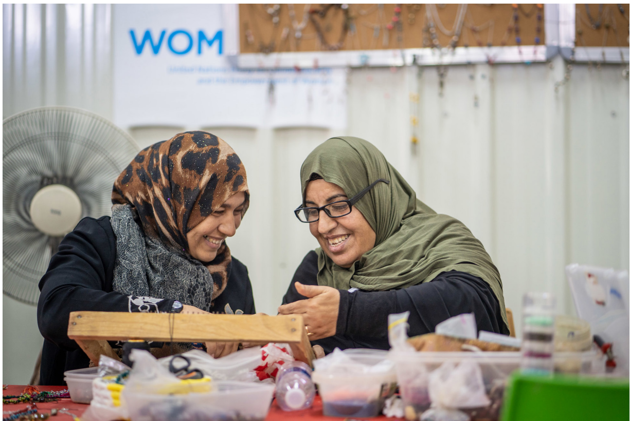
Syrian refugee women in Jordan Zaatari camp.