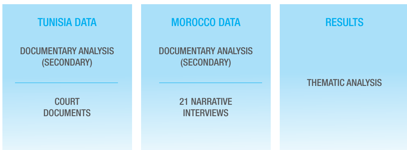
TABLE 2: SUMMARY OF METHODS IN TUNISIA AND MOROCCO

to violent extremism. Interviews were conducted with 21 Moroccan women to understand why Islamic State appealed to them. Of these 21 interviews, five were conducted in Fez and Rabat with women violent extremists, seven were conducted in Tangiers, Fnideq, and Ceuta with families of extremists and women’s groups, and twelve were conducted in Casablanca, Rabat, Madagh and Fez with women religious leaders. This interview data was interpreted with the aid of secondary statistical studies; official documents, NGO and news reports, and violent extremist group materials (propaganda review, leaflets, statements, etc).