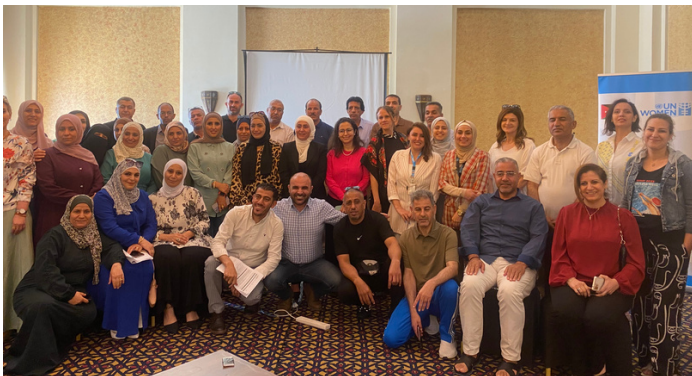
Oasis Centres and Ministry of Social Development strategize at a retreat to further empower Jordanian and refugee women, with funded from the EU Madad Fund.

In an impactful two-day retreat, the 18 Oasis Centres, operating across 11 governorates in Jordan which are funded by EU Trust Fund 'Madad', convened with the Ministry of Social Development (MOSD) to refine and enhance their support programs for vulnerable Jordanian and refugee women.