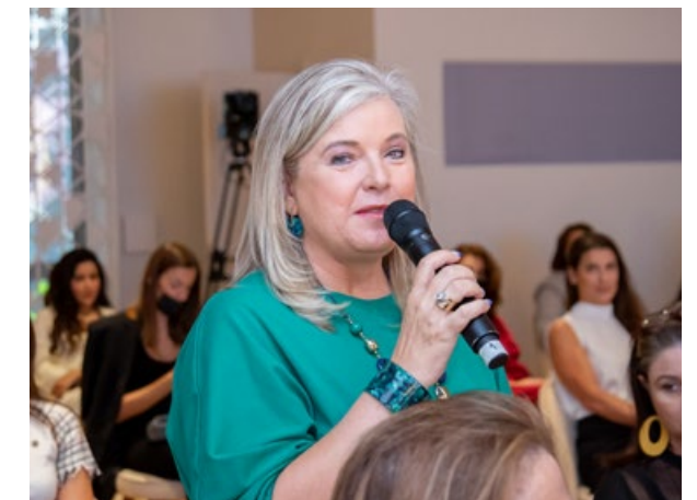
A business owner asking a question to the panelists at a mentoring event in Dubai, November 2021.