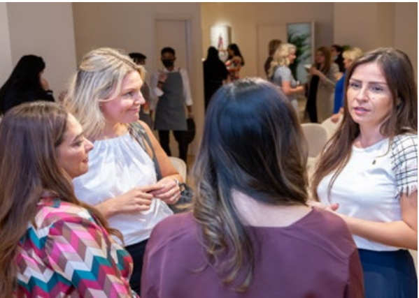
A group of business owners gathering during a networking event in Dubai, November 2021.

While in the Central Bank UAE Survey, 65 per cent of medium companies and 50 per cent of small companies reported the positive impact of audited financial statements on access to credit, which sends a clear signal that financial transparency and the use of external audit increases MSME “bankability”, WOBs, being mostly in micro enterprises and in services or trade, found audited financial statements a hindrance. They need support at the early stages of their businesses. Providing financial support only to well-established businesses is stopping many potential business projects and plans from flourishing and thriving in the local economy. Many participants in discussions and interviews cited this challenge, as they need microfinancing at the very early stage of their business which is, however, provided only by some mechanisms: