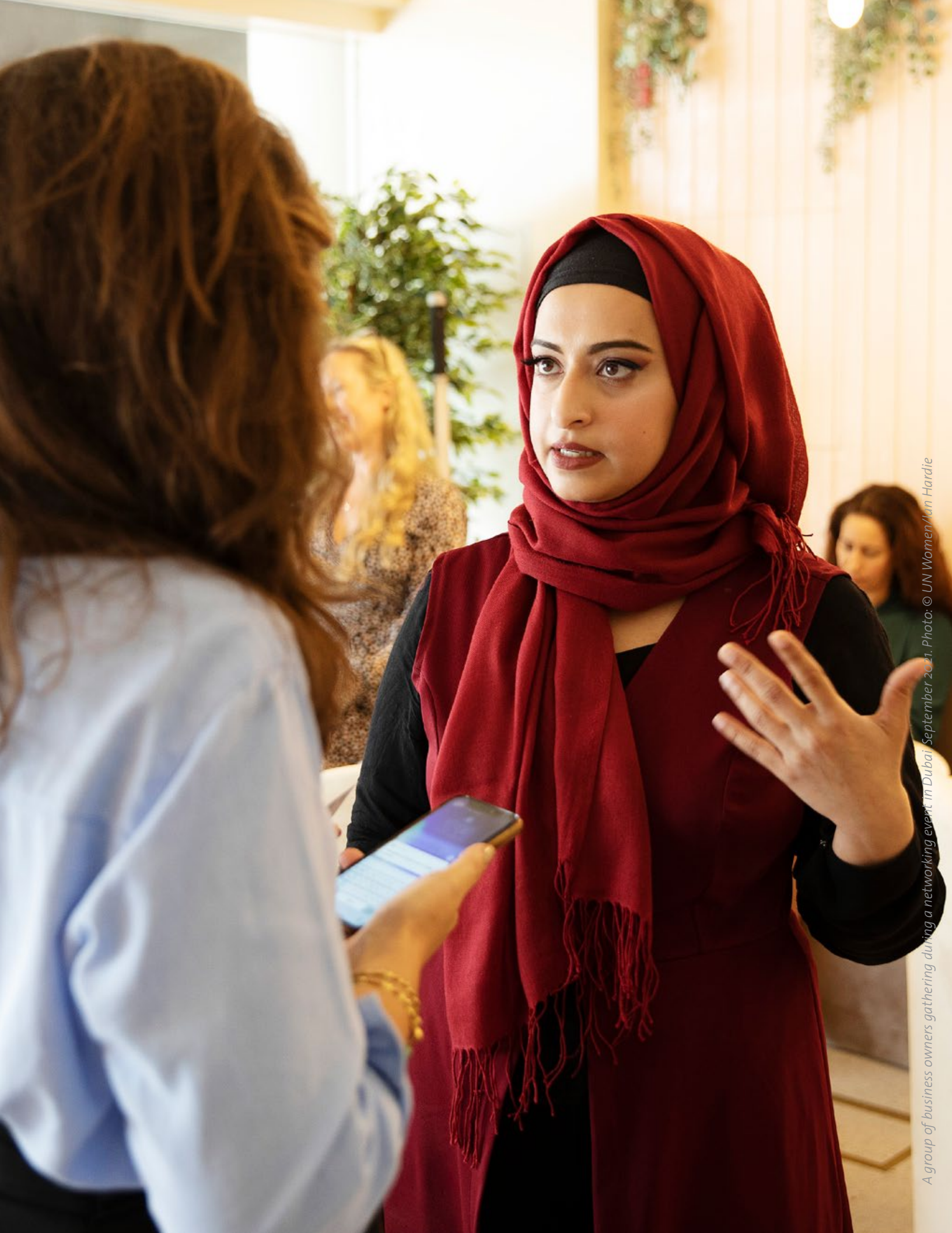
A group of business owners gathering during a networking event in Dubai, September 2021.