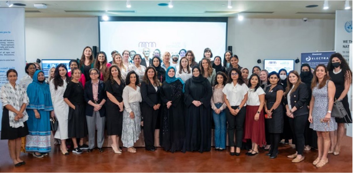
Entrepreneurs participating in the “Meet the Buyer” event at Expo 2020 Dubai, March 2022.

The following sections provide a review of the issue of access to finance for SMEs in general and WOBs specifically, and the different lending and equity options available in the UAE. Financial and non-financial barriers for WOBs in the UAE are described. Global benchmarks of successful women-targeted financing initiatives are discussed. Finally, recommendations are proposed for actions that government, financial institutions and other stakeholders can potentially take to improve WOB's access to finance.