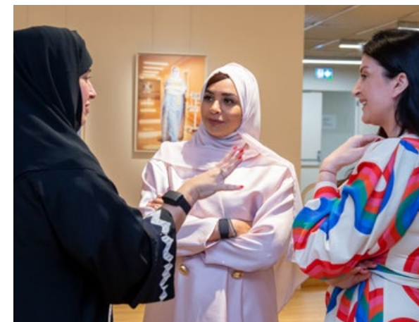
A group of business owners at a networking event in Dubai, November 2021.

Yet, many challenges and needs are still hindering their growth from micro enterprises to become SMEs.