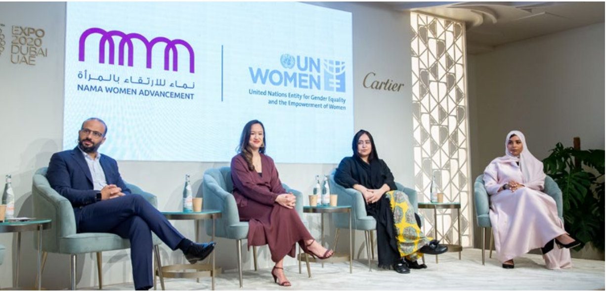
Panel discussion, “The Power of Mentoring for Women entrepreneurs”, at Expo 2020 Dubai, November 2021.

Meeting with other entrepreneurial ecosystem stakeholders such as financial institutions, commercial banks and government agencies allowed the researcher to triangulate the data sources and ensure the credibility and validity of the research findings.