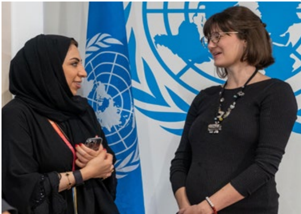
A procurement practitioner and a business owner in discussion at the “Meet the Buyer” event at Expo 2020 Dubai, March 2022.